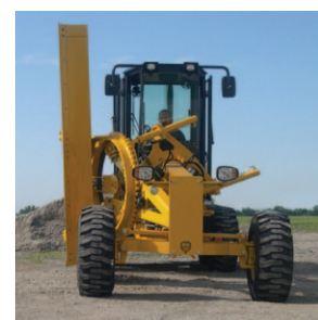
90° Bank slope saddle