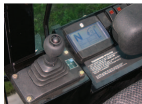
Full power shift transmission with torque converter